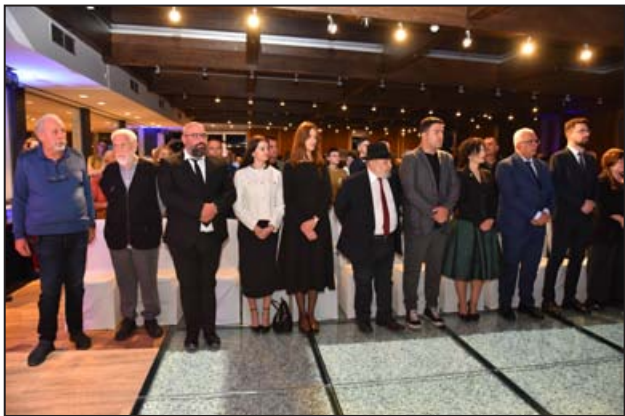
Učešće na Maharu u Budvi Participation at the Mahar in Budva (OKT 2024)