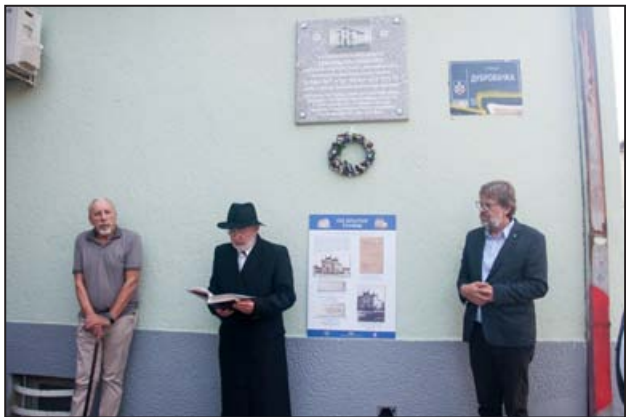
Verski obred Religious ceremony (SEP 2023)