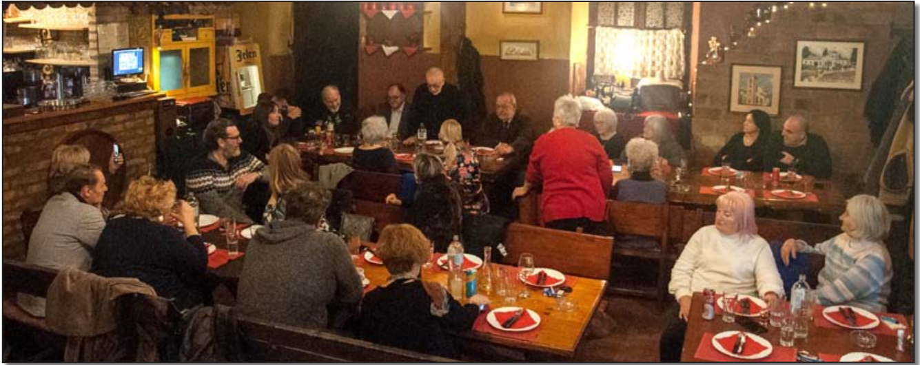
Purim (MAR 2023)