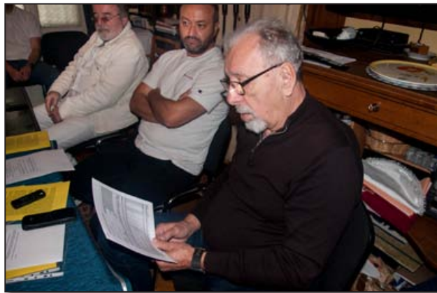
Izlaganje predloga budžeta Presentation of the budget proposal (MAJ 2024)