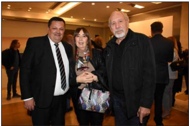
Svečanost Dana Zemuna sa gradonačelnikom opštine The Zemun Day ceremony with the municipality mayor (NOV 2024)