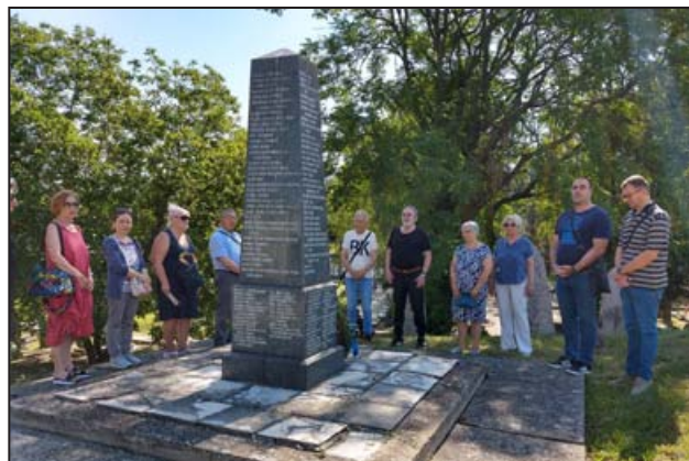
Komemoracija zemunskim Jevrejima na Jevrejskom groblju Zemun Commemoration of Zemun Jews at the Zemun Jewish Cemetery (JUL 2023)