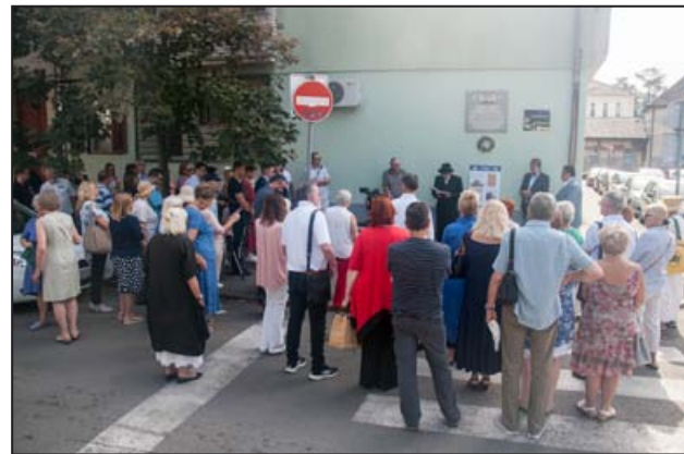
Prisutni na otkrivanju spomen ploče The audience at the unveiling (SEP 2023)