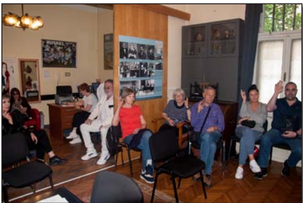
Članovi glasaju na Redovnoj Skupštini Members voting at the Regular Assembly (MAJ 2024)