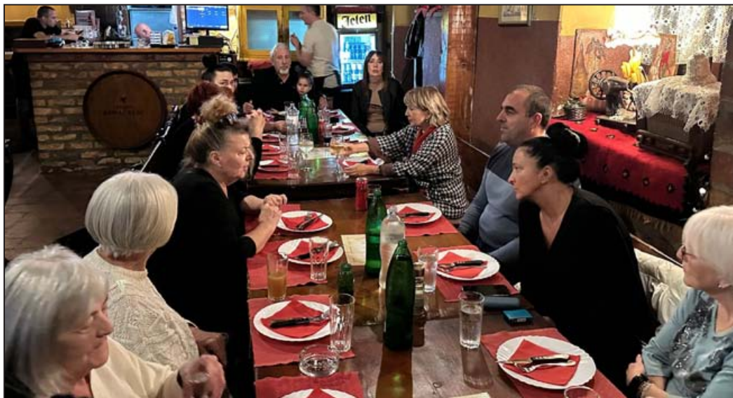
Roš Hašana - Rosh Hashana (OKT 2024)