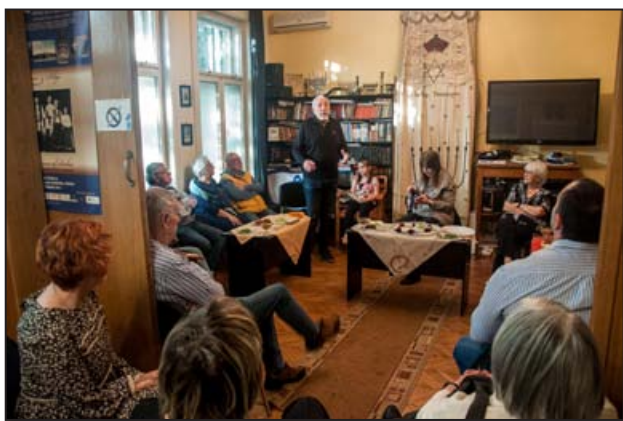
Pesah (APR 2024)