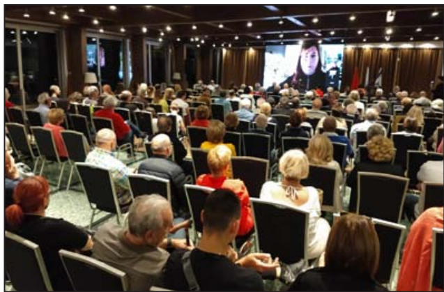
Učešće na Maharu u Budvi Participation at the Mahar in Budva (OKT 2023)