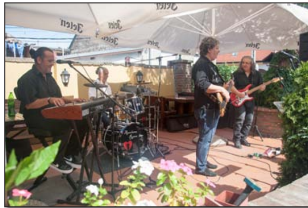
Grupa 'Apsolutno romantično' na promociji The 'Absolutly Romantic' group at the promotion (SEP 2023)