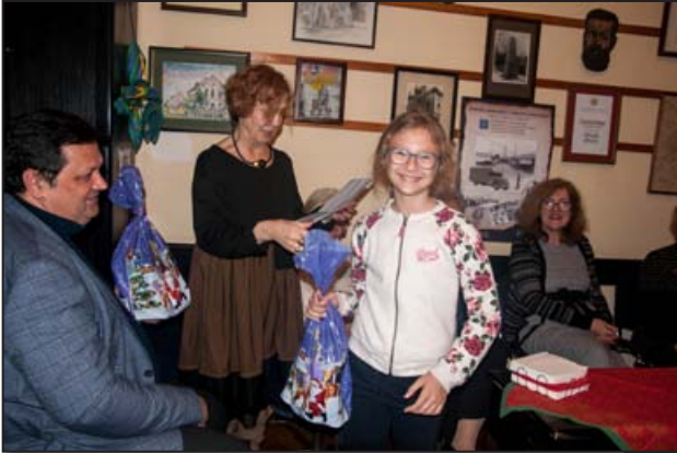
Hanuka - Hanukkah (DEC 2022)