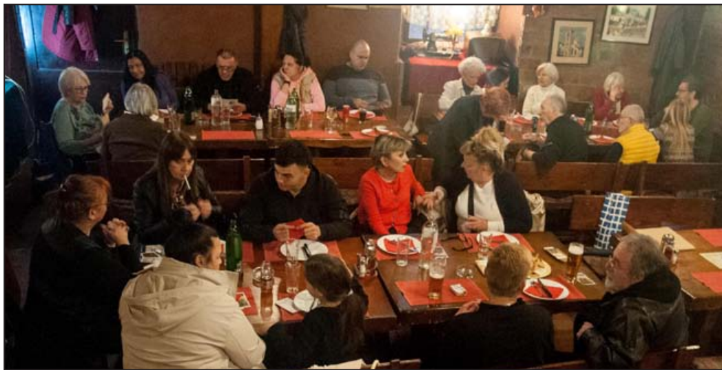
Purim (MAR 2024)