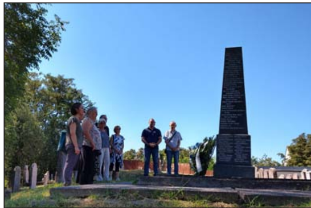
Komemoracija zemunskim Jevrejima na Jevrejskom groblju Zemun Commemoration of Zemun Jews at the Zemun Jewish Cemetery (JUL 2024)