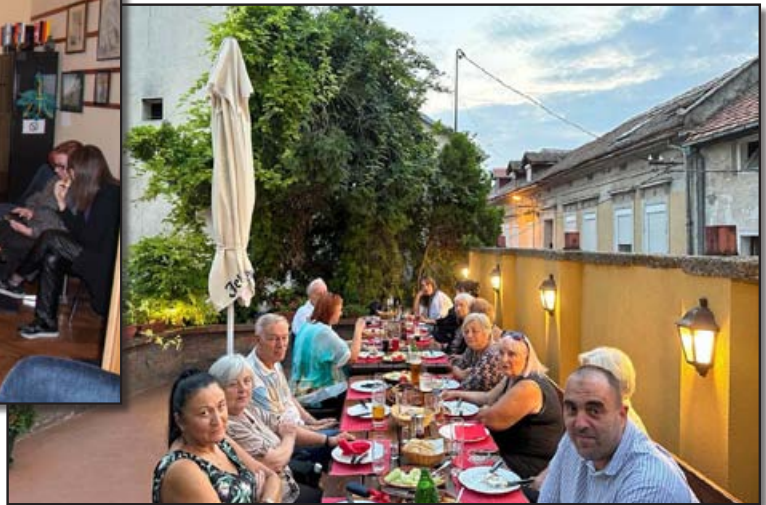
Roš Hašana - Rosh Hashana (SEP 2023)