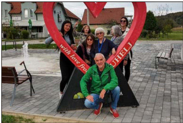
Učešće na DOR, Tuheljske toplice Participation at the DOR, Tuheljske toplice (SEP 2024)