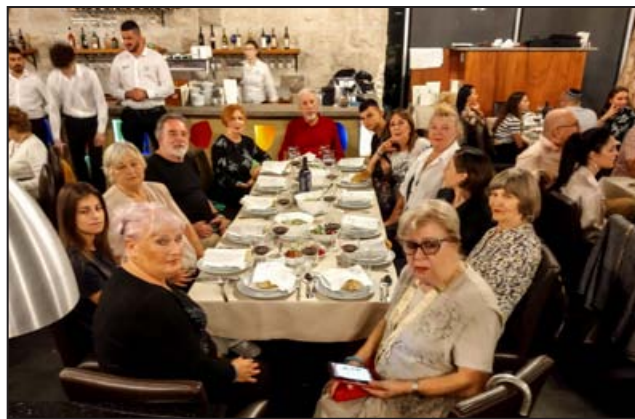
Šabat večer na Maharu u Budvi Shabat Evening at the Mahar in Budva (OKT 2023)