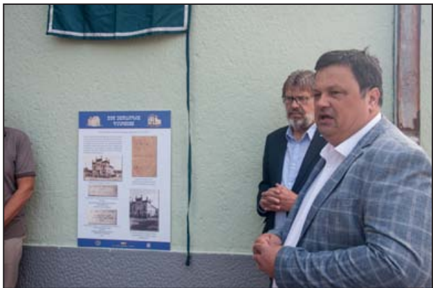
Obraćanje gradonačelnika Gavrila Kovačevića Speech by Mayor Gavrilo Kovačević (SEP 2023)