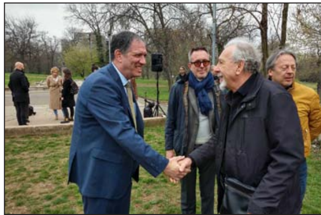
Sađenje u Parku izraelsko-srpskog prijateljstva Planting at the Israeli-Serbian Friendship Park (MAR 2024)