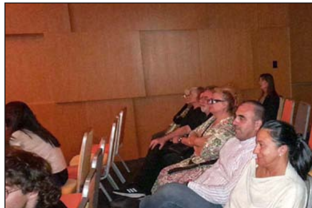
Učešće na DOR, Tuheljske toplice Participation at the DOR, Tuheljske toplice (OKT 2023)