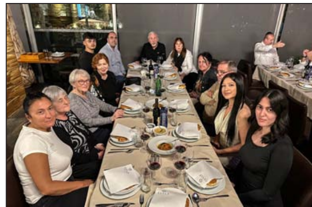
Šabat večer na Maharu u Budvi Shabat Evening at the Mahar in Budva (OKT 2024)