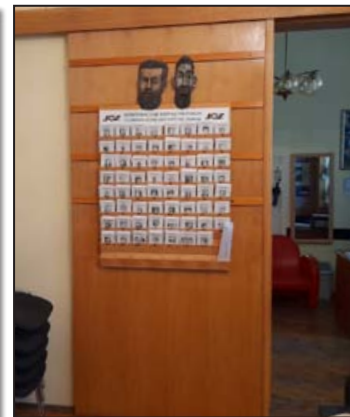
Uređenje sale naše opštine Arrangement of our community's hall (APR 2024)