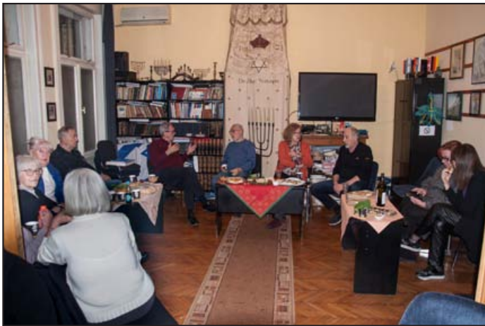
Pesah (APR 2023)