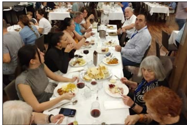
Šabat večer na DOR, Tuheljske toplice Shabat Evening the DOR, Tuheljske toplice (SEP 2024)