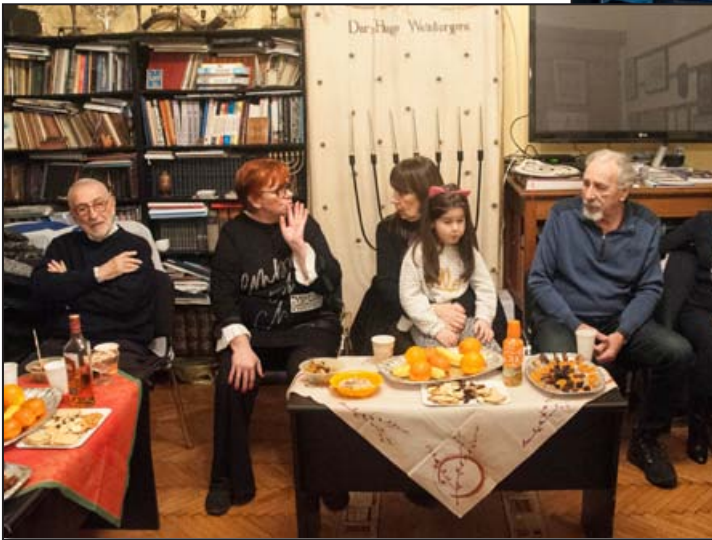
Tubišvat - Tu BiShvat (FEB 2023)