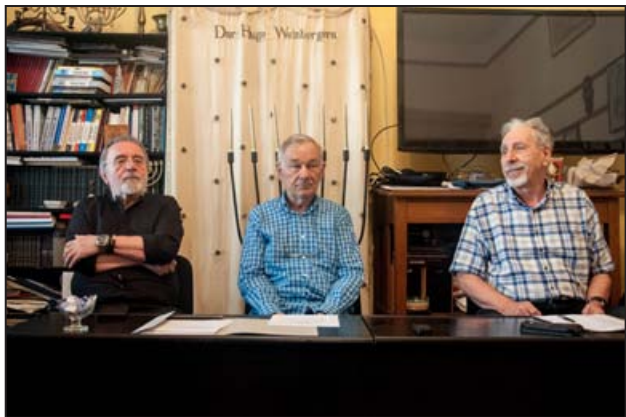
Redovna Skupština JOZ The JCZ Regular Assembly (JUN 2023)