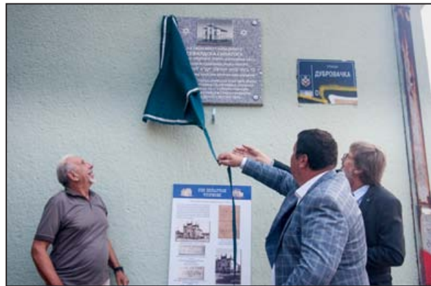
Otkrivanje spomen ploče Unveiling of the memorial plaque (SEP 2023)