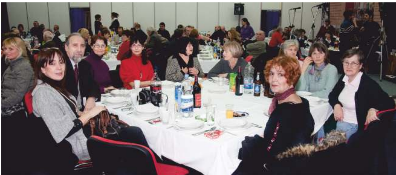
Zemunci na Šoletu u Novom Sadu - Zemunians on Sholet in Novi Sad (2010)