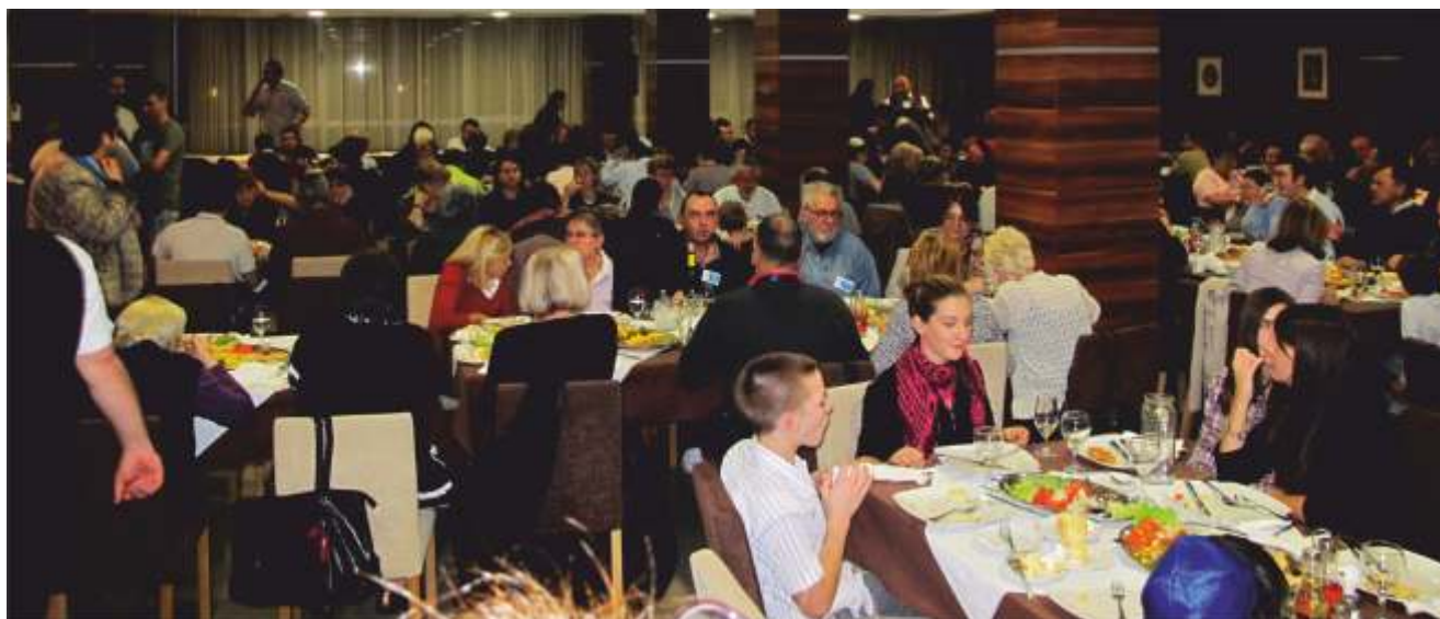
Limud Kešet u Subotici - Limmud Keshet in Subotica (2009)