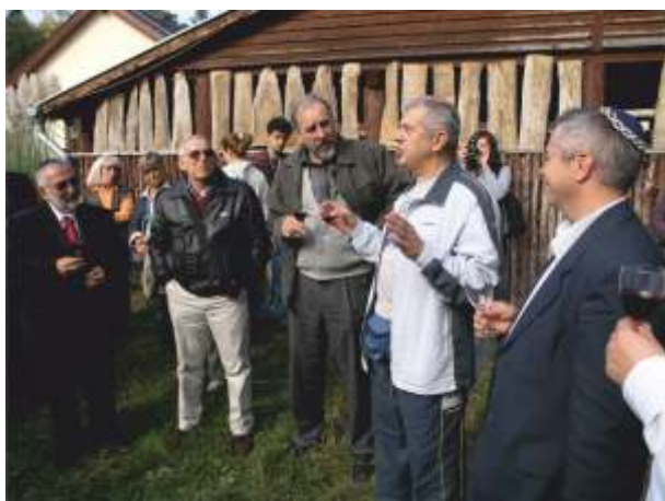
Dobrodošlica za Sukot u Osijeku The Welcoming Speech at the Sukkot Event in Osijek (2008)