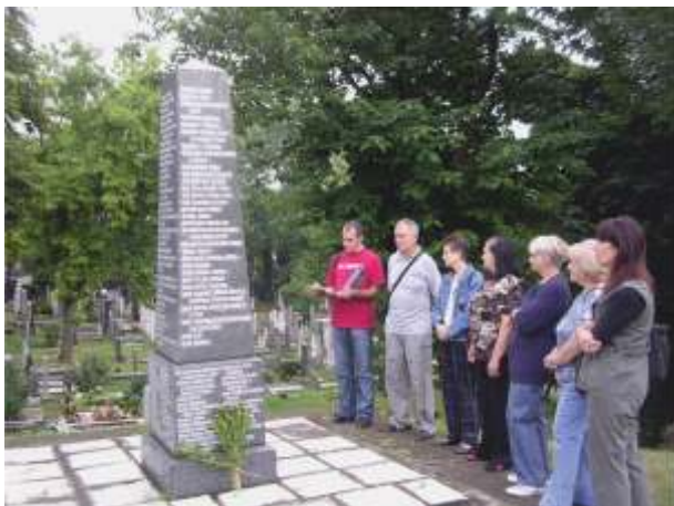
Komemoracija Zemunskim žrtvama fašizma Commemorating Zemun's victims of Fascism (2008)