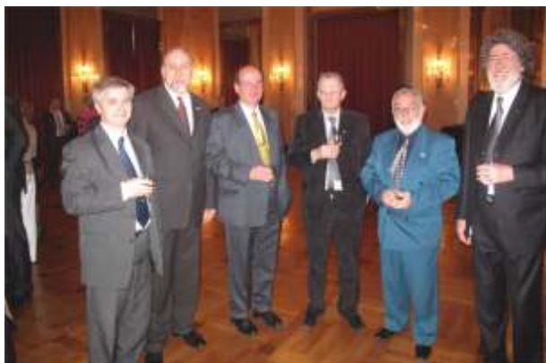
Dan državnosti Izraela u Skupštini Beograda Yom Ha'atzmaut in Belgrade City Hall (2009)