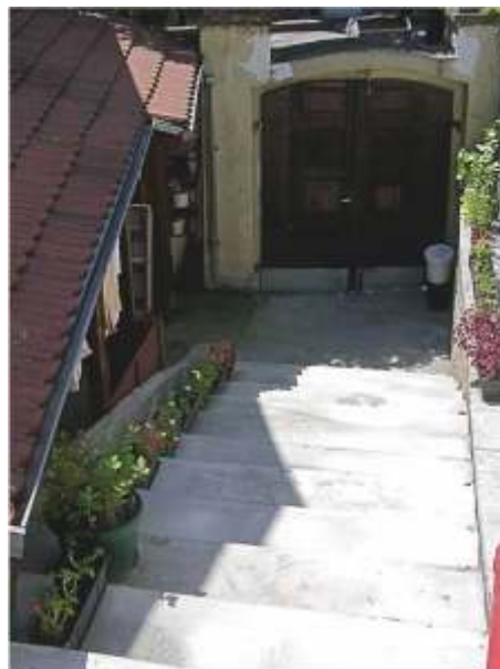
Obnovljeno stepenište na našem groblju Our cemetery's renovated stairs (2008)