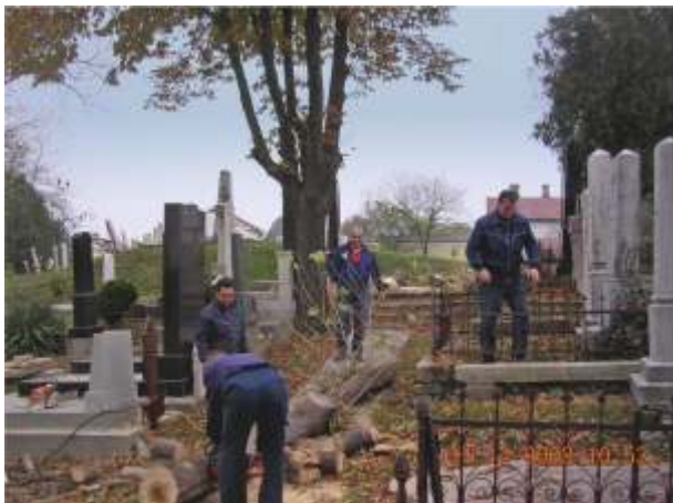
Akcija! Odžavanja našeg groblja Set for Action! Tending to our cemetery (2008)