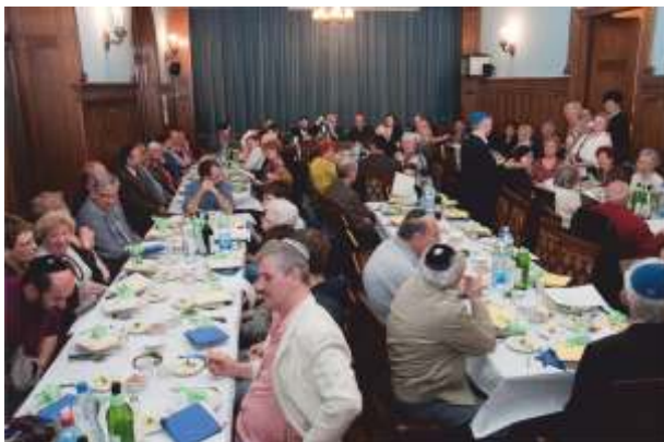
Pesah - Seder vece u Subotici Pesach - Seder Evening in Subotica (2009)