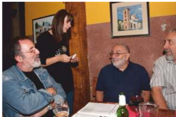
Evropski dan jevrejske kulture u Zemunu The European Day of Jewish Culture in Zemun (2009)