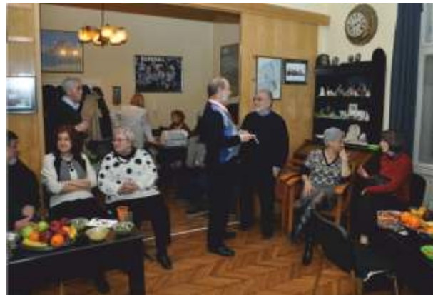
Proslava Tubišvata u Zemunu Celebration of Tubishevata in Zemun (2009)