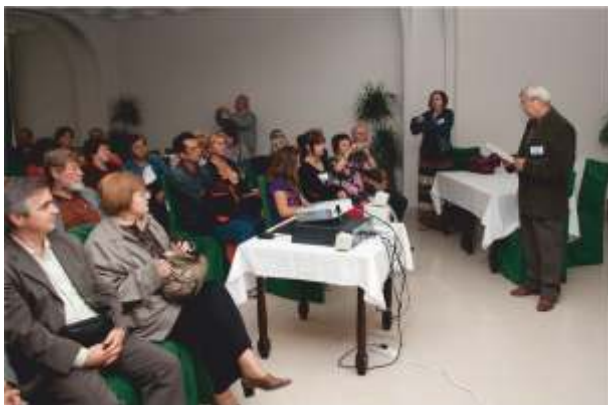
Evropski dan jevrejske kulture u Kikindi The European Day of Jewish Culture in Kikinda (2009)