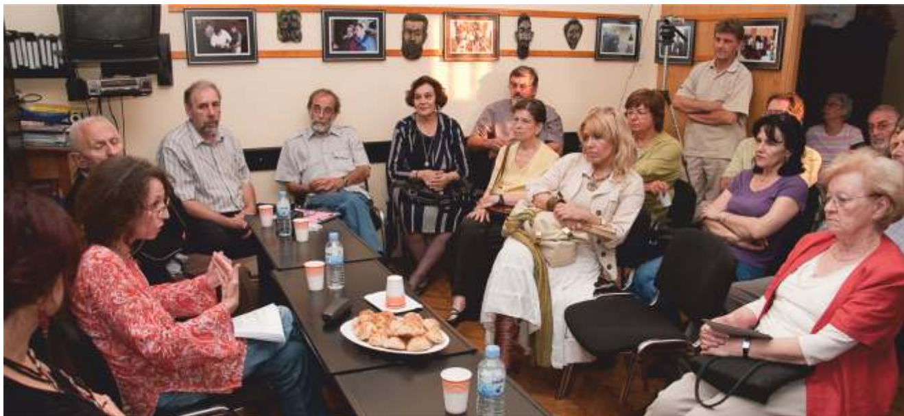
Predavanje: Žena u ortodoksnom judaizmu - Lecture: Woman in Orthodox Judaism (2009)