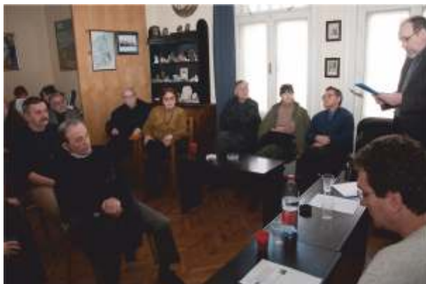
Izborna Skupština u JO Zemun JC Zemun Annual Meeting – Voting of Leadership (2009)