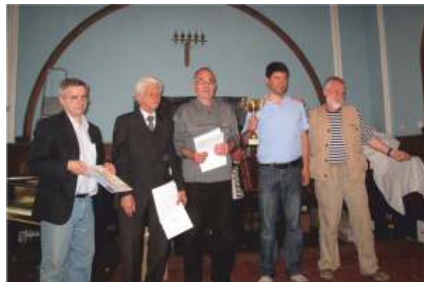
Prvi internacionalni turnir u šahu u Subotici The First International Chess Tournament in Subotica (2009)