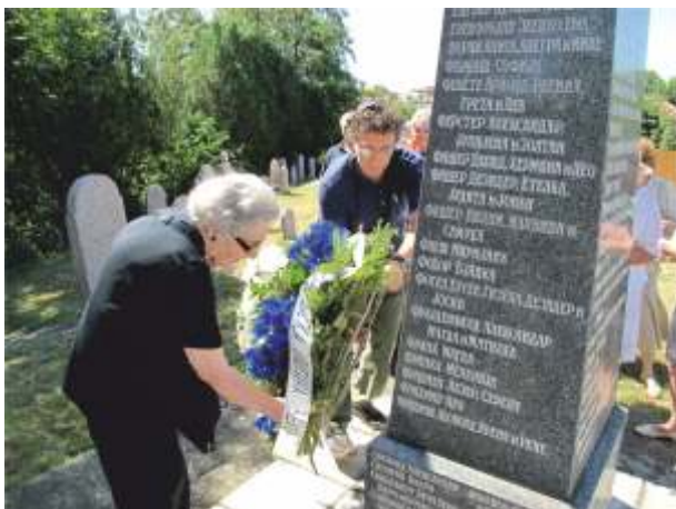
Komemoracija stradalim Jevrejima Zemuna Commemorating Jewish victims from Zemun (2009)