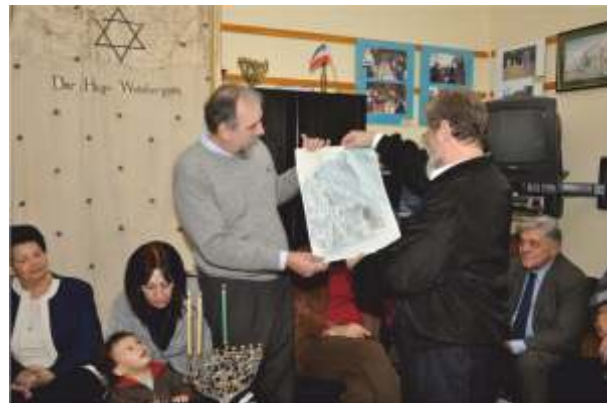
Darivanje, Hanuka u Zemunu Presenting Gifts, Hannukah in Zemun (2008)