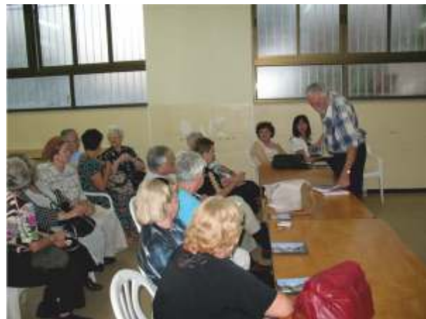
Promocija JO Zemun u Jerusalimu Promotion of the JC Zemun in Jerusalem (2008)