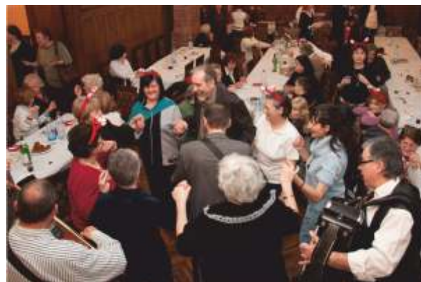
Veseli Purim u Subotici A Merry Purim in Subotica (2010)