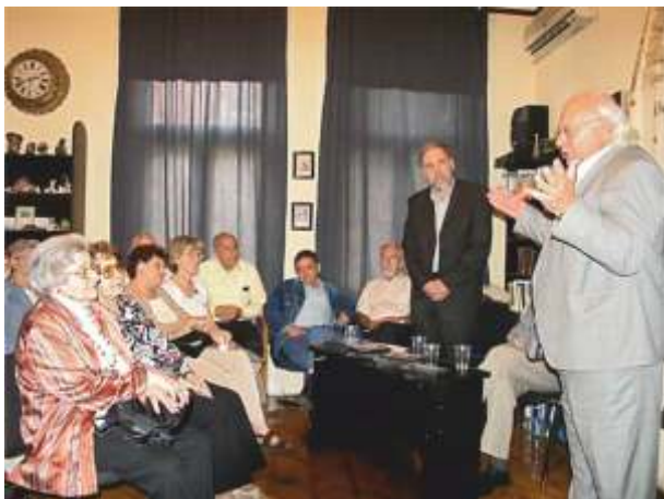
Promocija CD-a o Jevrejskom groblju u Zemunu Promotion of Jewish Cemetery Zemun CD (2008)