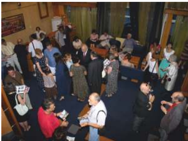
Evropski dan jevrejske kulture u Zemunu The European Day of Jewish Culture in Zemun (2008)