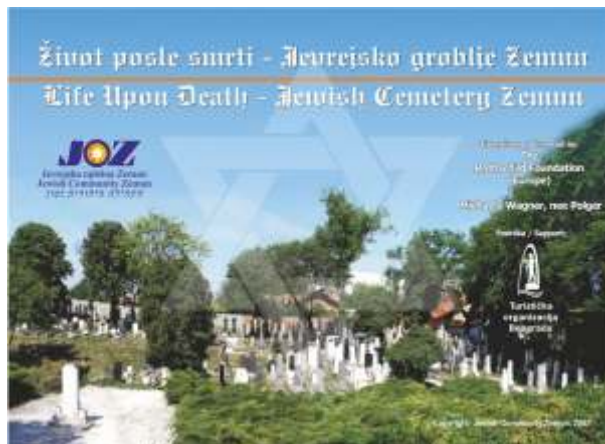
Multimedijalni CD o Jevrejskom groblju u Zemunu The Jewish Cemetery Zemun multimedia CD (2008)