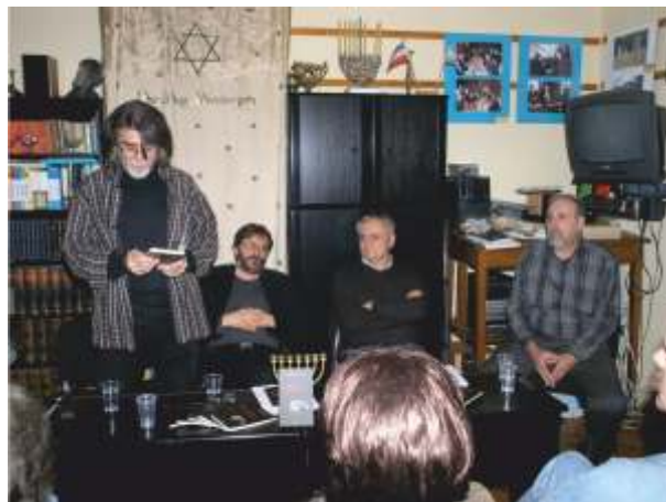
Poetsko ve e sa Vojislavom Brkovi em An Evening of Poetry with Vojislav Brkovic (2008)