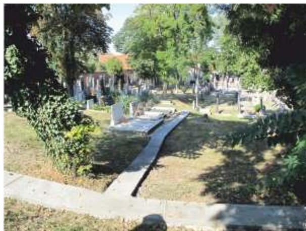
Novoizgradene staze na našem groblju Newly built paths in our cemetery (2009)