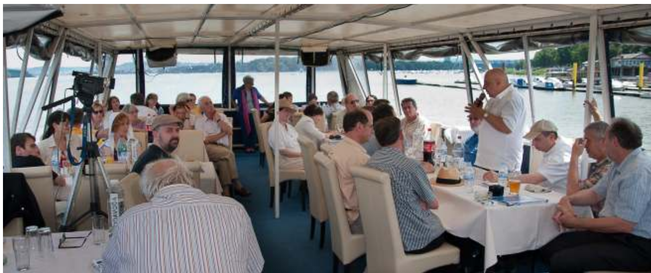
"Kol Zemun" na Dunavu - "Kol Zemun" on Danube river (2009)