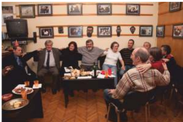
Srecni zajedno - Purim u Zemunu Happy together - Purim in Zemun (2009)