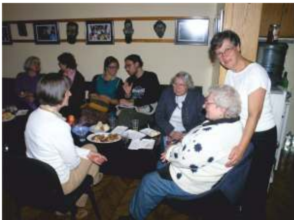
Obeležavanje Roš Hašane 5769 u Zemunu Marking Rosh Hashana 5769 in Zemun (2008)