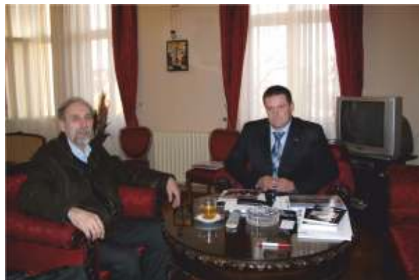
Poseta Gradskoj opštini Zemun Visit to the Zemun Municipality (2010)