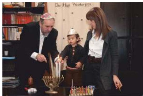
Prvi put na paljenjenju svecica - Hanuka u Zemunu Lightning Candles for the First Time - Hannukah in Zemun (2009)