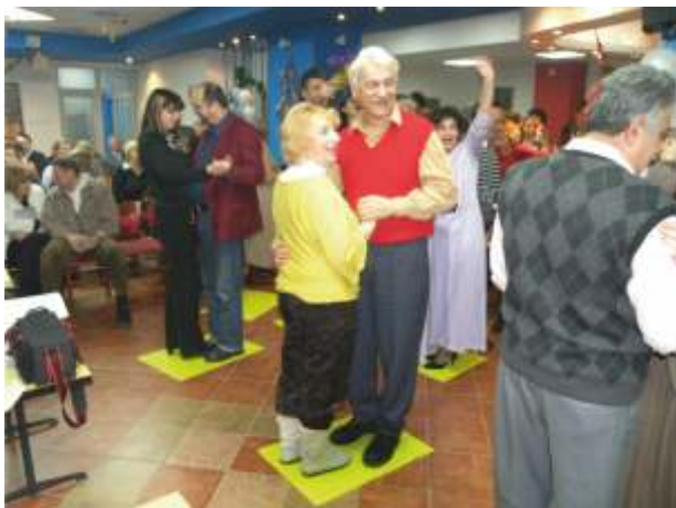
Igra za Hanuku u Pan evu Hannukah dance in Pancevo (2008)