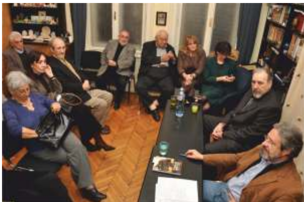
Ve e izraelskog filma u JO Zemun Evening of Israeli film in JC Zemun (2008)