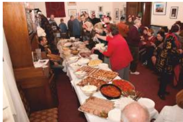
Gozba za Purim u Subotici Purim Feast in Subotica (2009)