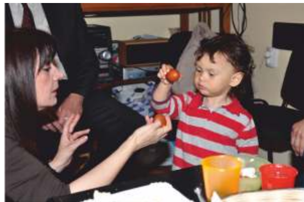
Pesah u Zemunu Pesach in Zemun (2009)