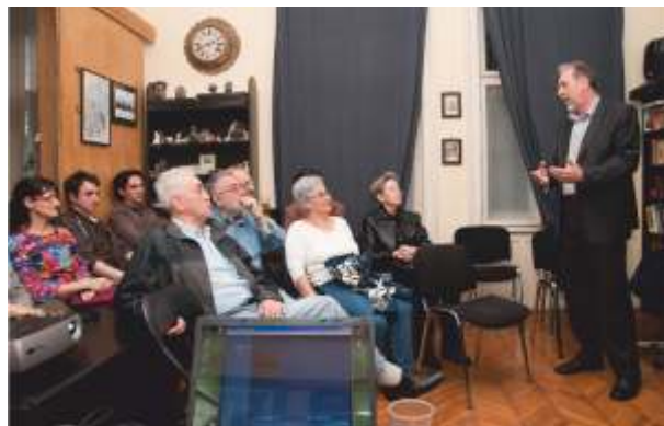
Okupljanje za Jom HaŠoa u JO Zemun Yom HaShoah gathering in JC Zemun (2009)