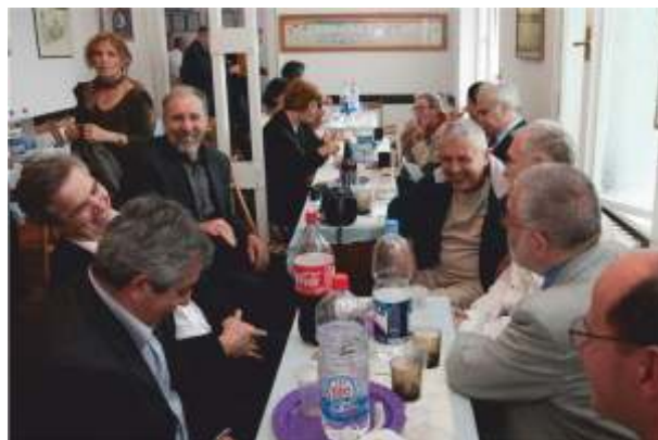
"Korak napred" - Zrenjanin The "Step Ahead" - Zrenjanin (2009)