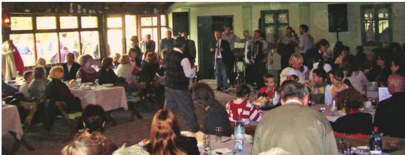
Hinenu u Subotici - Hinenu in Subotica (2008)