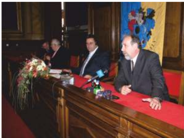
Drugi regionalni susret u Hodmezevašarhelju The 2nd Regional Meeting in Hódmez vásárhely (2008)