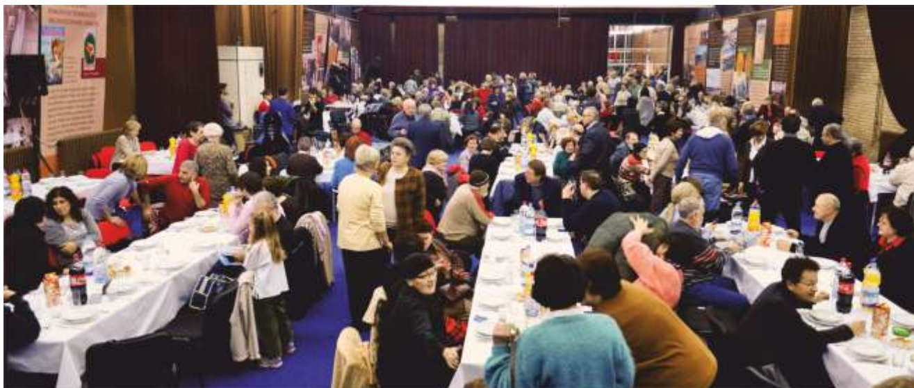
Druženje za Šolet u Novom Sadu - Sholet socializing in Novi Sad (2009)