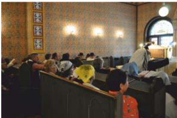
Roš Hašana u Subotickoj sinagogi Rosh Hashana in Subotica Synagogue (2009)